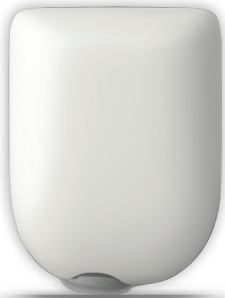
Pod shown without the necessary adhesive